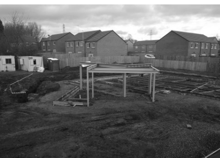
Foundations laid—Jan 2015

The walls are going up fairly quickly and the building is now starting to take shape. There is still a lot of work to be done,