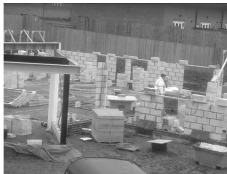
Walls start to go up—Feb 2015

It has been confirmed that, during the entirety of the building works, that we will not have access to our car park, but we have spoken with Coventry City Council and they have agreed to put a new Disabled Parking bay on the road outside the surgery but all other patients and staff will, unfortunately, have to find parking elsewhere. Can we please encourage patients that do use their cars to be mindful of the local residents and to please park carefully and considerately.